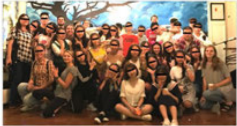
Some of the students who came to one of our parties!

While these first seven weeks have gone by so quickly, I have had a really hard time adjusting to EA life this year. There have been times of happiness and joy at being back in this country with these incredible people, but there have also been times of loneliness and isolation (and missing my sweet boyfriend of course). On top of that I have had a really