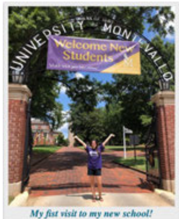
My first visit to my new school!

On a logistical note, if you are currently donating to me monthly, you need to go in and end your monthly donations! If you do not stop these by the end of this month, they will go to the Cru general fund, and not to me!