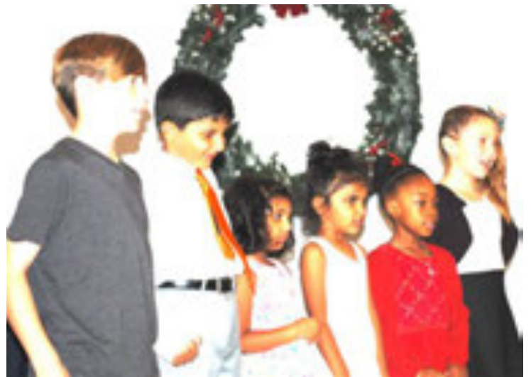
Some of our Sunday school kids singing.