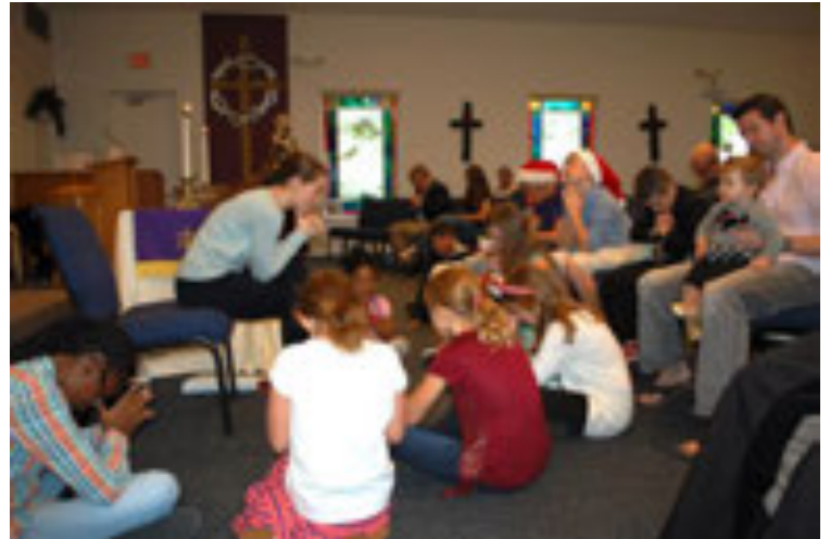
We love our Glades kiddos!

Take a small bank and put it on the table where you eat. Say a prayer and put 2¢ a person in the bank. These donations will grow and when filled, bring it to church and put it in the 2¢ bank. At the end of the year, these donations will be sent to several organizations who help others less fortunate.