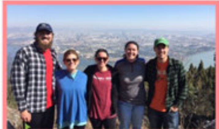
Our Launch Trip team on top of the beautiful (and sunny!!) city of Kunming

Hello again! I will be traveling over these next five weeks, so I wanted to keep y'all in the loop as to what we will be doing since it will be awhile before y'all hear from me again! The Launch Trips that I told y'all about in the last newsletter went really well. My team got the opportunity to go to a city in another Province called Kunming, and it was such a beautiful place! It is the first location I have been to in East Asia with consistently BLUE SKIES!!! It was so refreshing to be able to have some good weather for a little over a week. During this time, we had the chance to explore a new University that our company has never been on, and we are so amazed at what we found. On