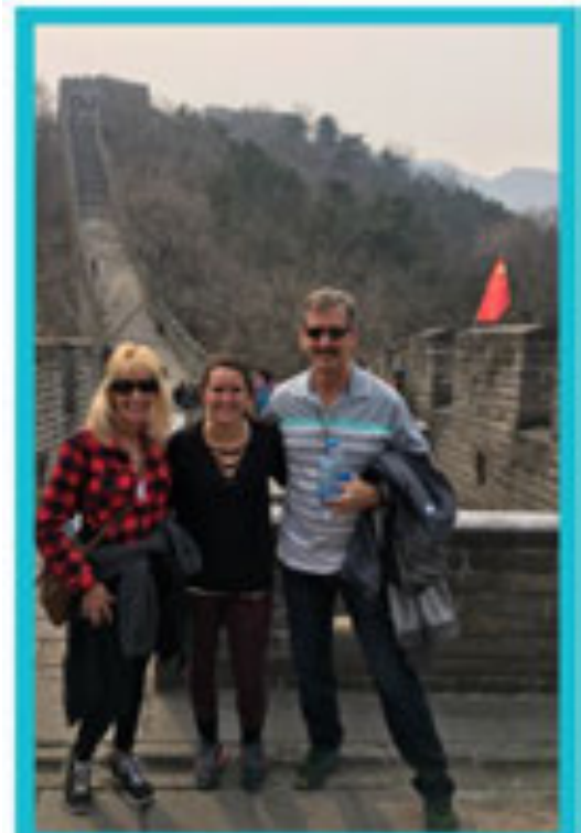
My parents and I exploring the Great Wall of China in Beijing!

"Declare his glory among the nations, his marvelous deeds among all peoples" -1 Chronicles 16:24